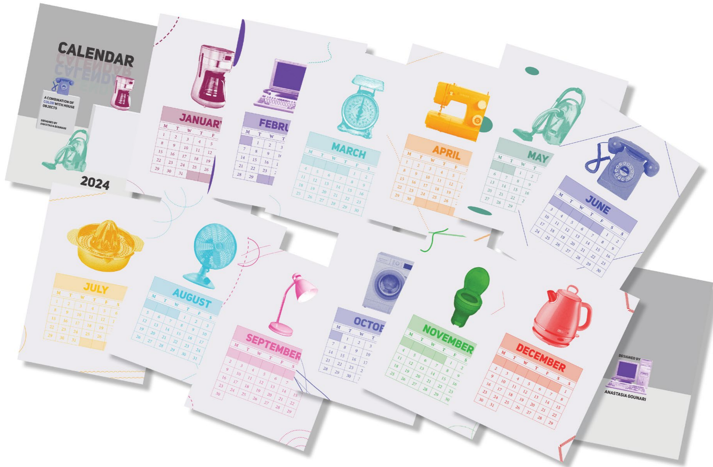
All the calendar pages