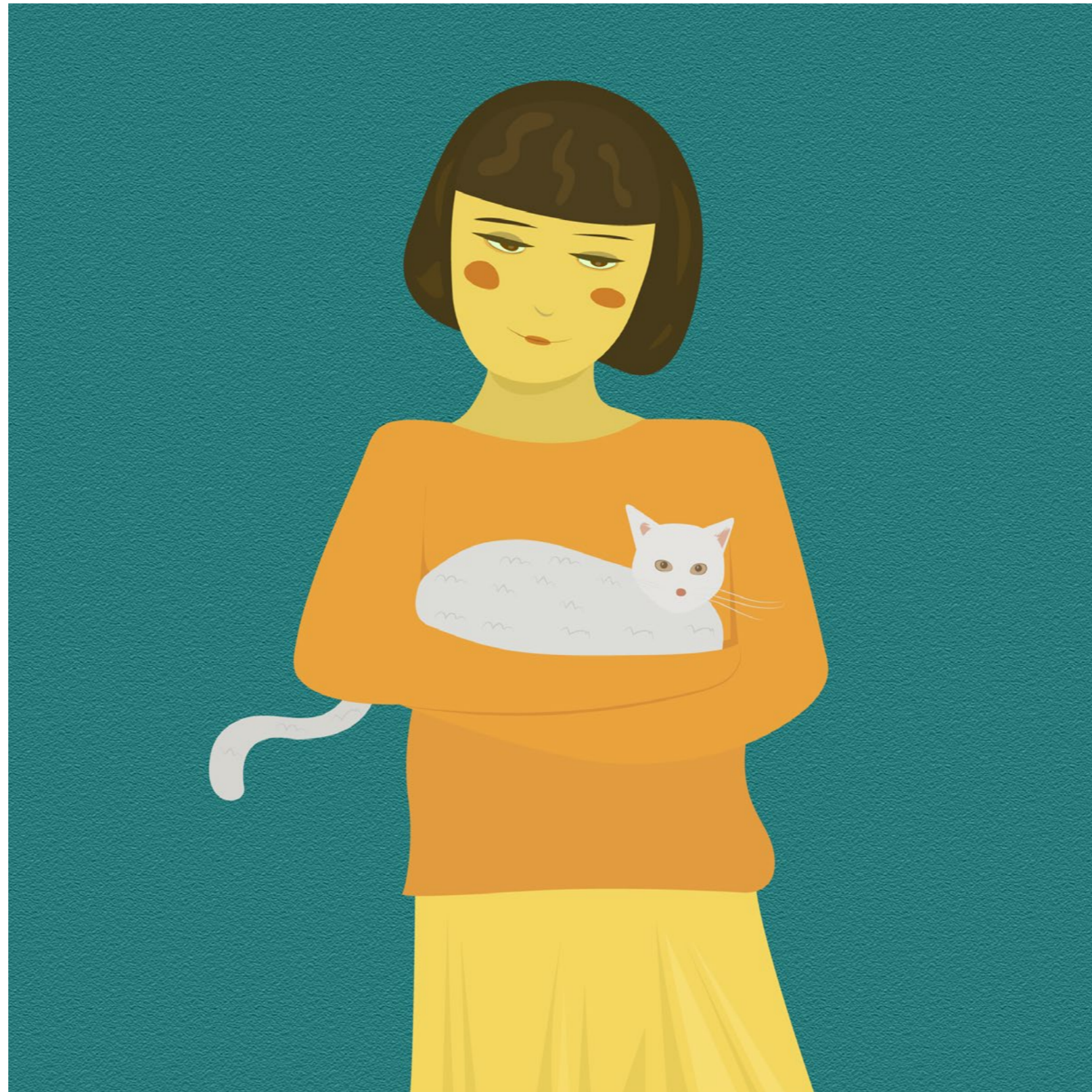
The girl with the cat