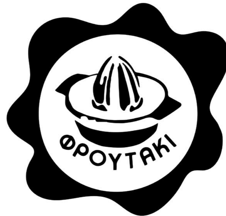
Logotype in white background