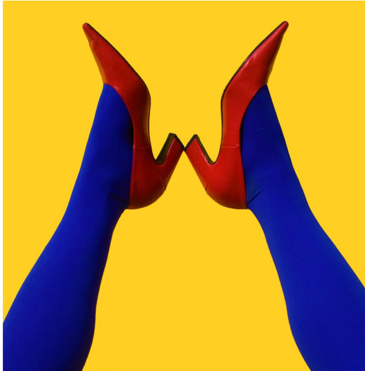
“A photography session I conducted with Marr Epstathiadi, focusing on the theme of Primary Colors”