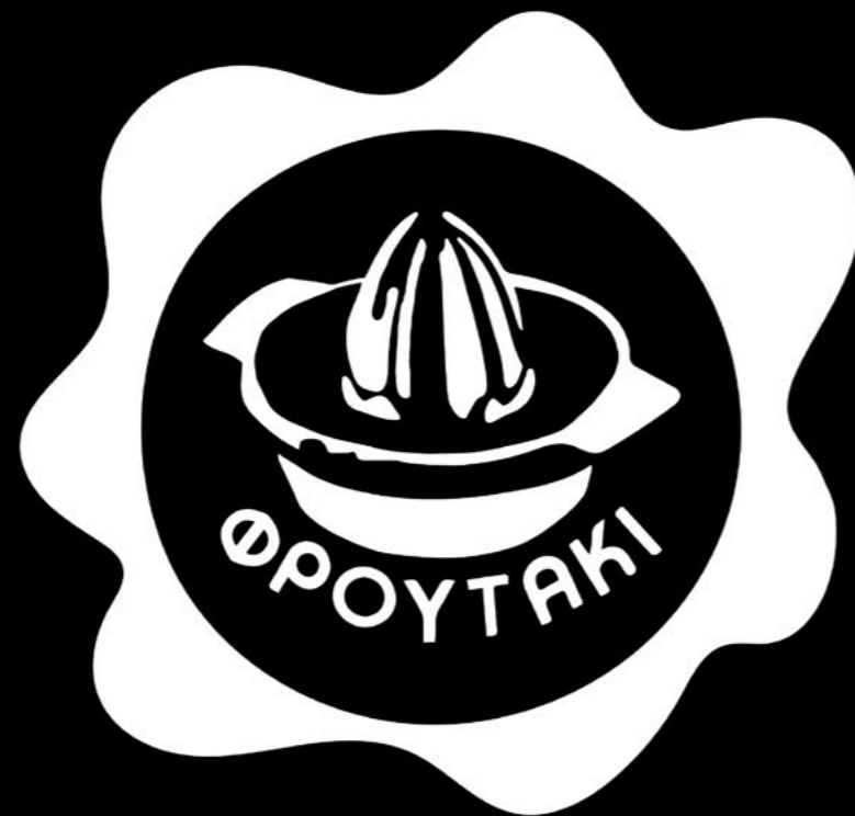
Logotype in black background