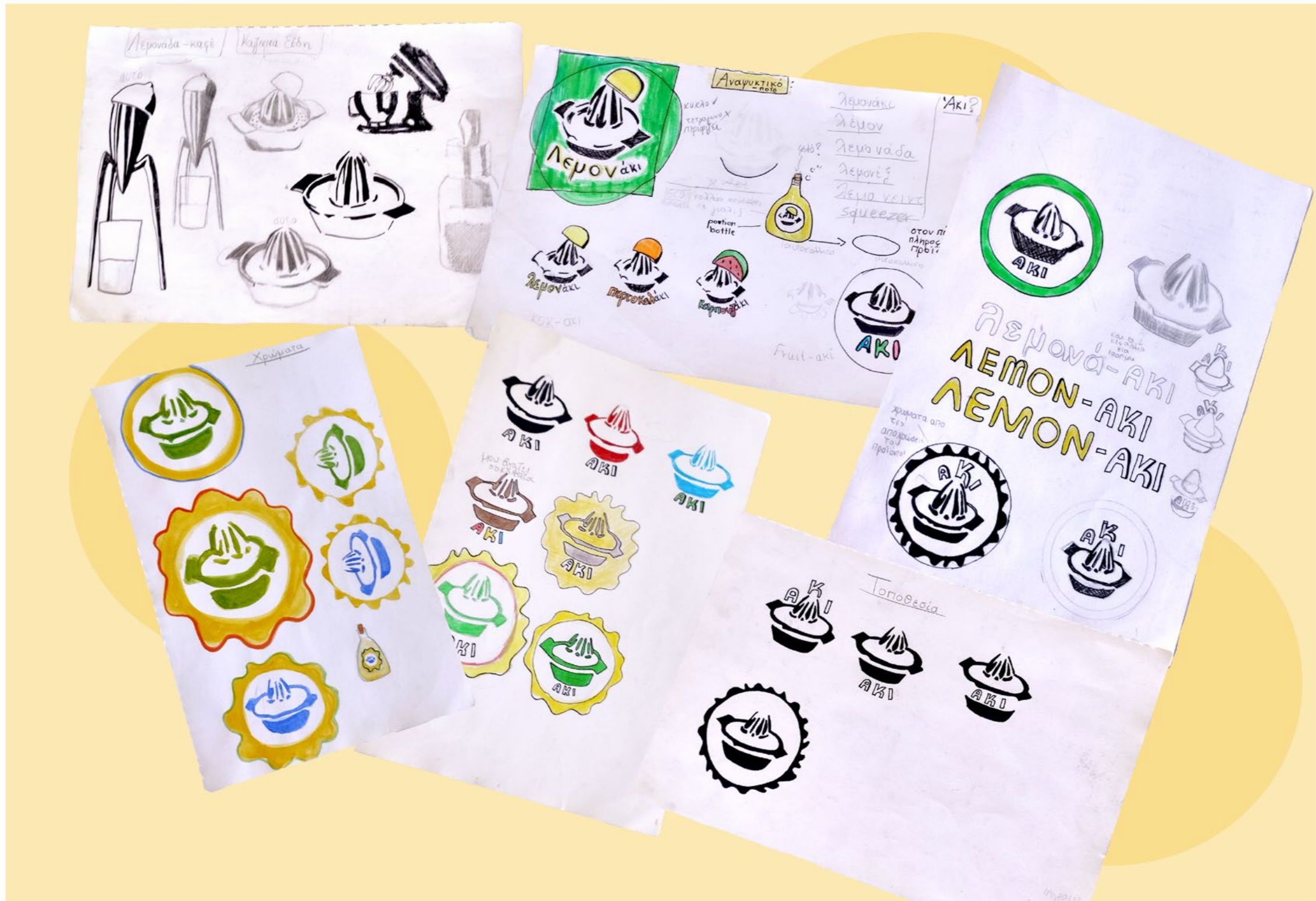
Some of the drafts