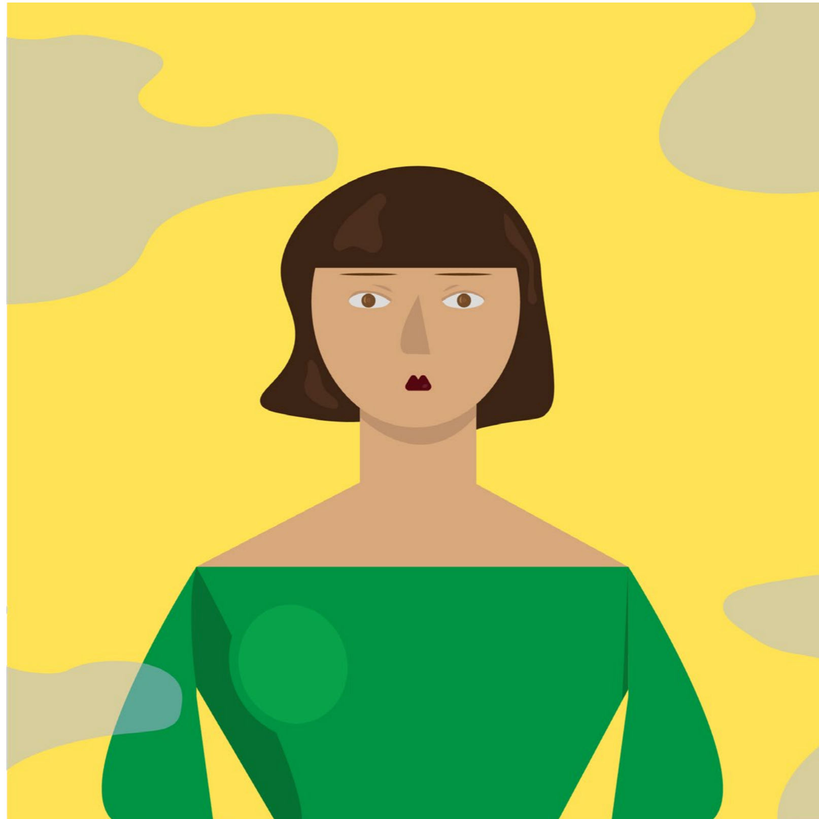
An illustration of me in Indesign